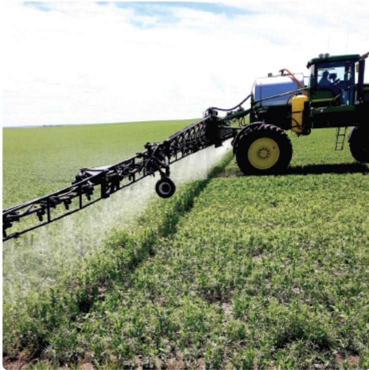
Figure 2. Spray application of a suspension of fine elemental S particles (Sulgro 70).