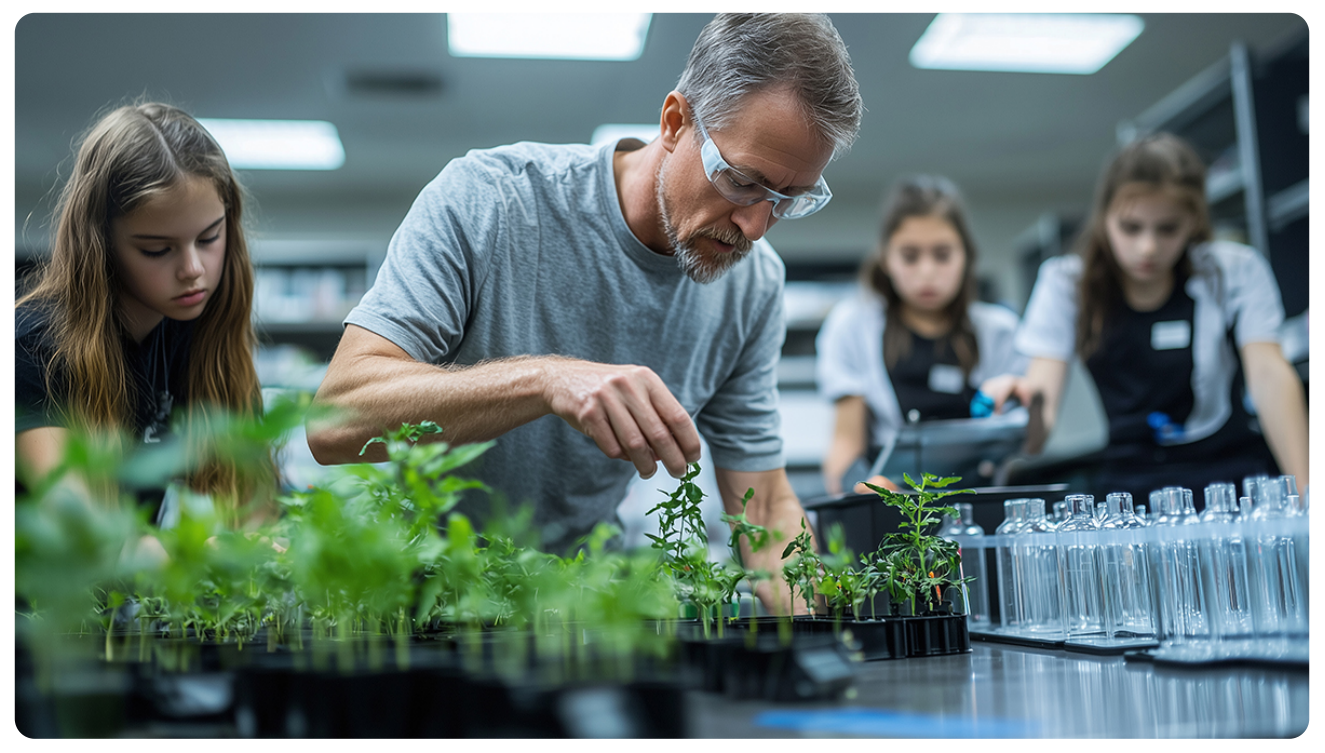
Al-generated image courtesy of Adobe Stock/ DOUGLAS.

The reach of our Societies extends beyond the USA. We aim to increase the international membership and footprint through scientific and technical engagement and discount membership pricing.