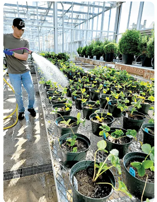
Ensuring optimum water condition in a strawberry greenhouse study at Purdue University.

Not adjusting photoperiod: The photoperiod is important when plants (especially the photoperiod-sensitive ones) are grown from seed to seed. Some crops like soybean and rice may only induce flowers once they have reduced photoperiod at their late vegetative stage. Therefore, adjusting the photoperiod is important until the experiment is limited to its late vegetative stage.