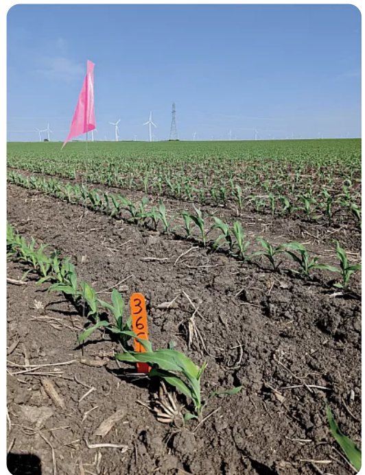
Stakes without specific treatment details for avoiding bias when collecting data.