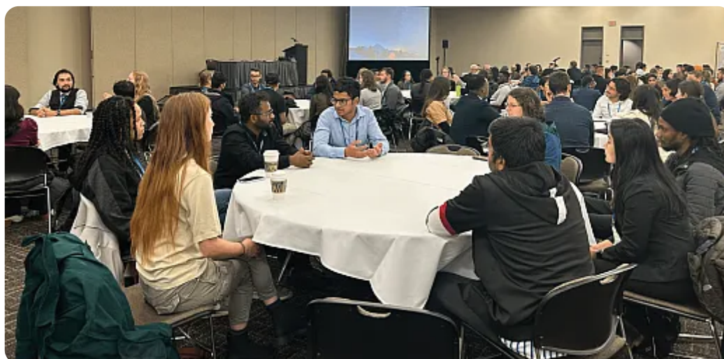
Graduate students and mentors participating in the Networking Session at the 2023 Annual Meeting.

The Annual Meeting in the fall is the premiere event of ASA, CSSA, and SSSA. It brings together around 4,000 stakeholders from across the United States and the globe. This includes researchers, scientists, policymakers, government employees, students, industry representatives, and others. The meeting provides ample opportunities for presenting your work and networking. If you have something to present, submit an abstract. If you don't, consider registering for the mega event as it is a great place to make connections and develop professional skills. The conference includes many sessions and workshops on the latest discoveries and important issues in agronomy, crop science, and soil science. It's also a place where collaborations are formed to drive innovation and advance scientific knowledge in these fields.