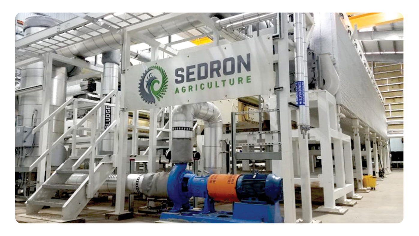
The Sedron Technologies advanced vapor recompression distillation (Varcor) system is designed to process liquid waste streams containing varying solid content.

Polymer-assisted solids separation, using systems like dissolved air flotation (DAF) or other fine-solids separation systems, is a relatively mature practice for waste management in general and is now becoming more common on dairies, especially where there is a desire to export surplus P off the farm. There are several DAF systems in use for dairy manure in the U.S. The Sedron evaporative technology is in the very early stages of development, and adoption with the first commercial systems is expected to start up on two large dairy farms in 2024.