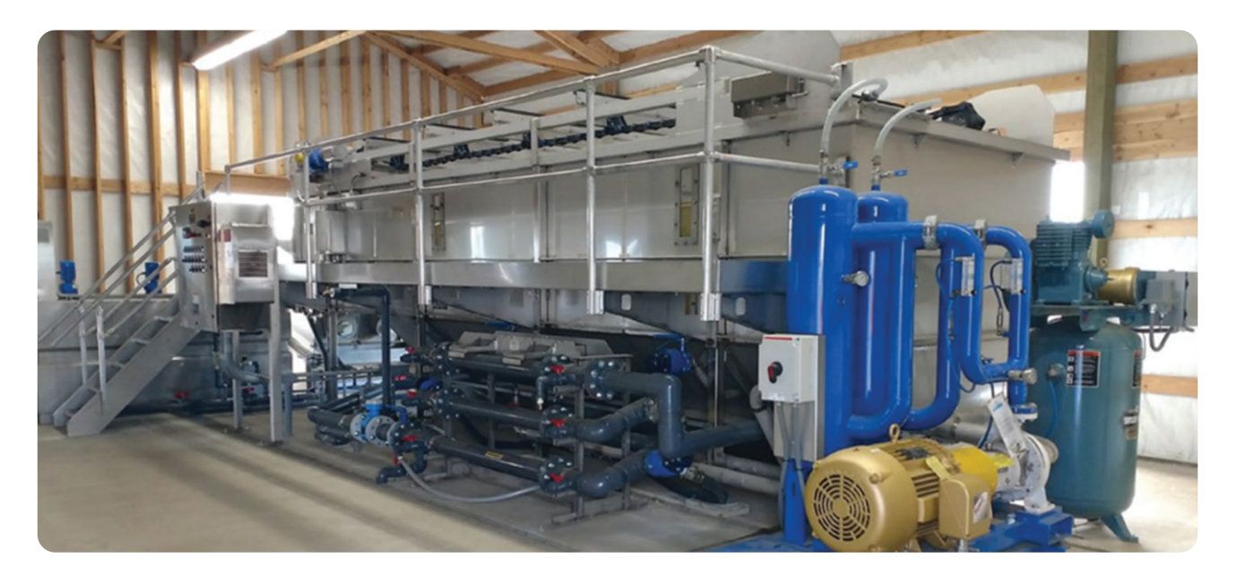
DVO dissolved air flotation nutrient recovery system.

reuse water is treated to desired quality standards, including those sufficient for environmental release, irrigation, reclaimed water, wastewater treatment discharge, being fed safely back to the cows. The solids produced are stable, dry, and free of pathogens, suitable for bedding or soil amendments. A concentrated ammonia solution is also produced. This ammonia-rich, stabilized liquid N contains about 10% nitrogen.