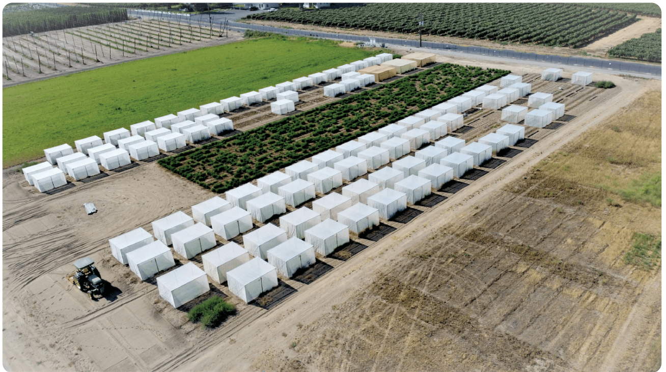
Alfalfa grow out at Prosser, WA including isolation cages.