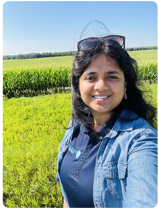
Figure 2. Scouting a corn field in eastern Nebraska.