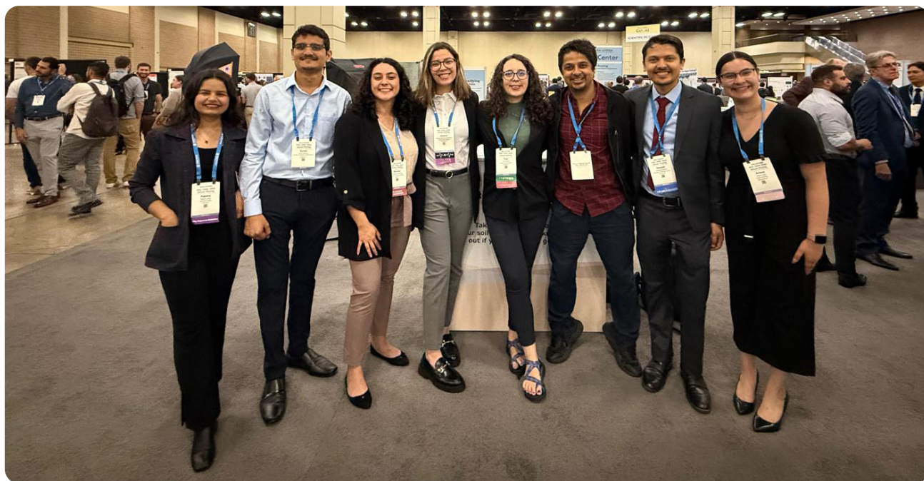
The ACS Graduate Student Committee members meeting in person at CANVAS 2025.