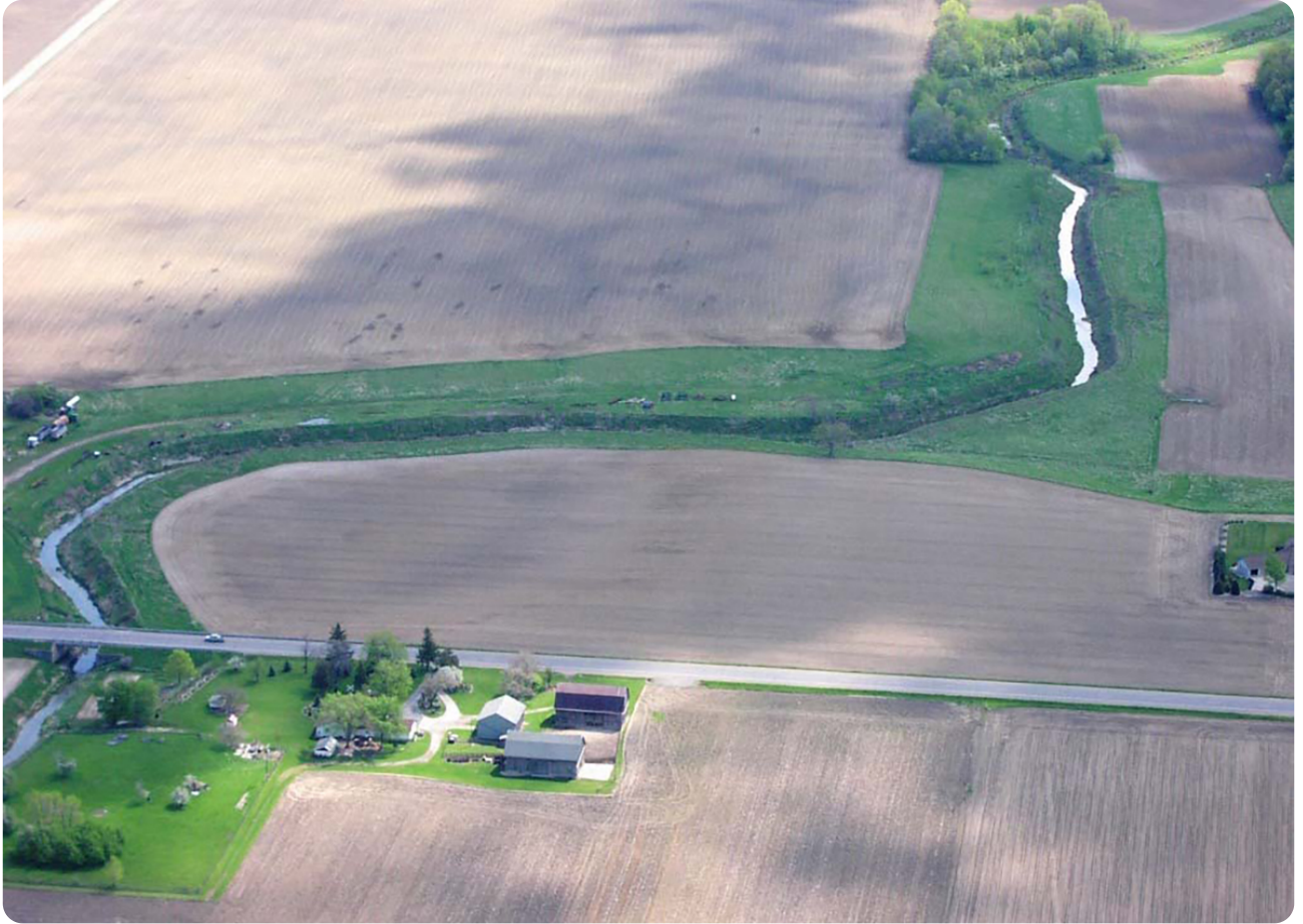
The Conservation Reserve Program (CRP) establishes and maintains vegetative conservation cover on highly erodible and environmentally sensitive land.