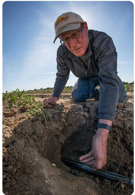
This farmer received funding from one such USDA conservation program, known as EQIP, to install micro-irrigation tubing in his tomato fields.

The Environmental Quality Incentives Program (EQIP) presents the greatest opportunity to manage PFAS for the widest range of farmers, ranchers, and forest stewards. This long-standing, nationwide program was established to help farmers control soil erosion, minimize nutrient and pesticide runoff to groundwater and surface water, and manage and optimize the use of fertilizer and other soil amendment inputs. Customers can also access financial assistance through EQIP's Conservation Innovation Grants (CIG) subprogram, which supports the development of new innovative tools, approaches, practices, and technologies to further natural resource conservation on private lands. The program could advance conservation measures and approaches that show promise for PFAS