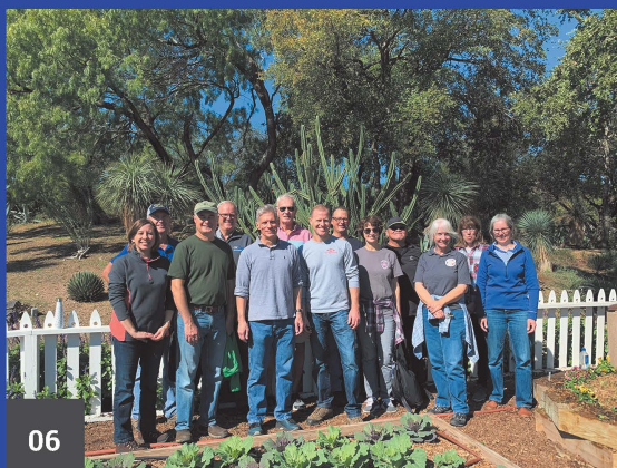
5 The city of San Antonio welcomed 3,997 attendees to our 2019 ASA, CSSA, SSSA Annual Meeting, 10–13 November.