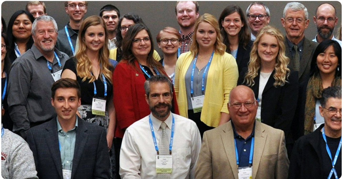
Awards Hub Lead February 2025