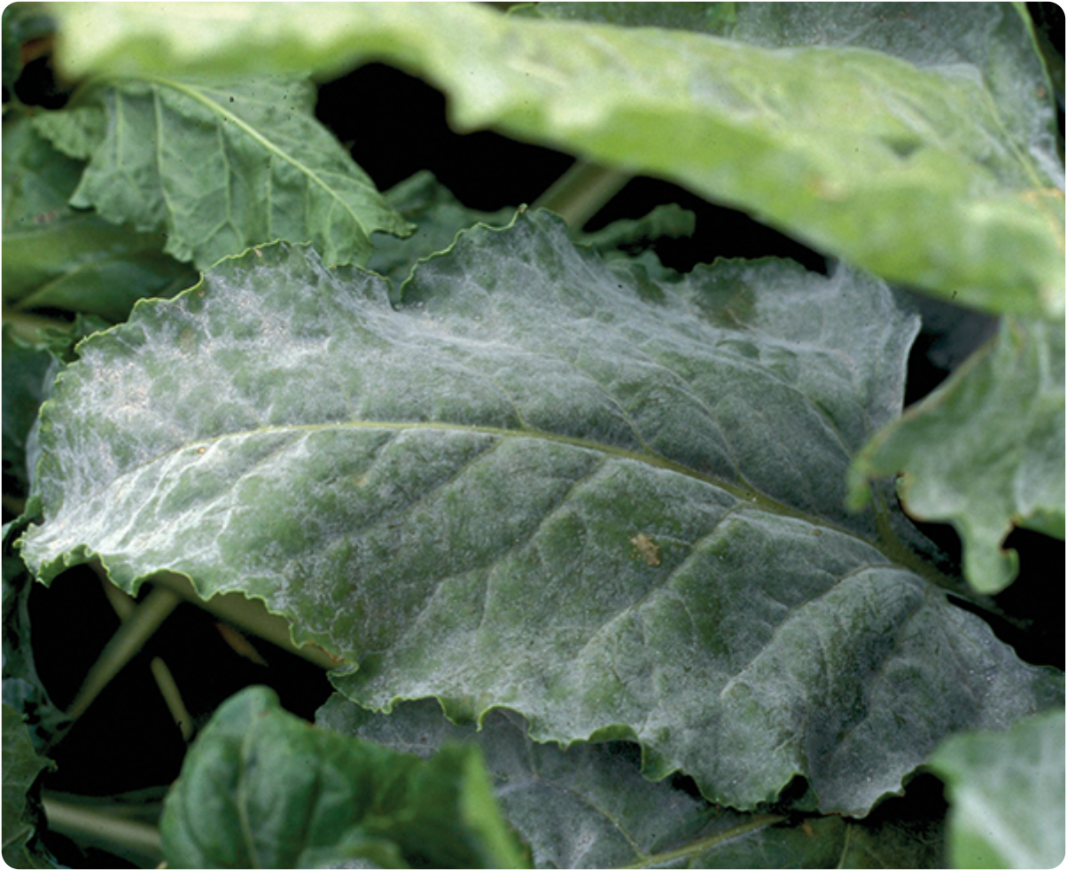
Sugarbeet leaf showing powdery mildew symptoms.