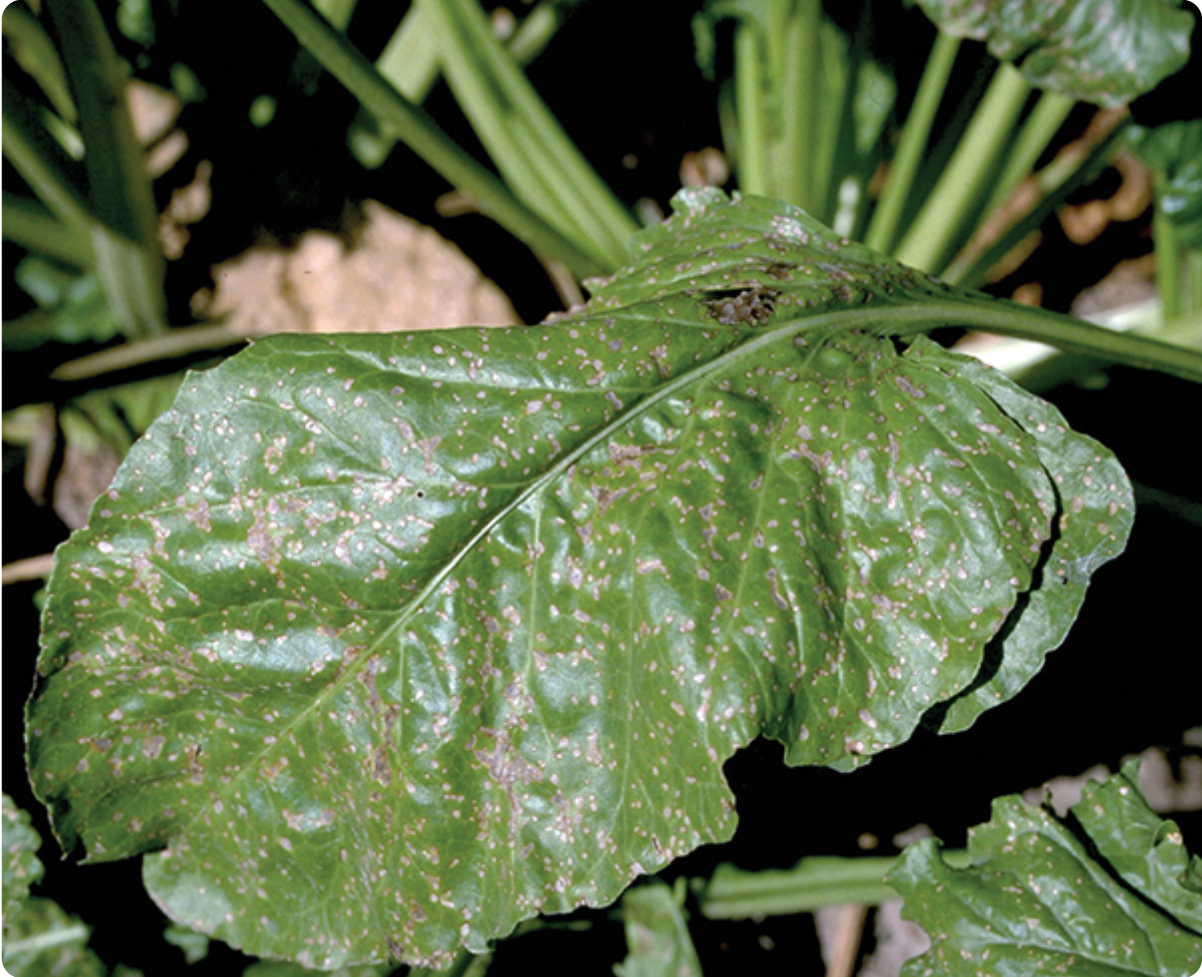
Sugarbeet leaf displaying symptoms of infection with Cercospora leaf spot.