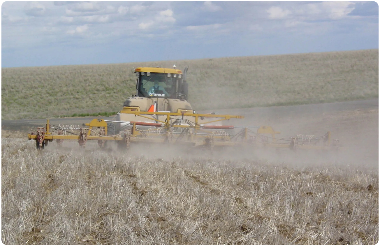
Undercutter tillage

Biosolids, produced as by-products of municipal wastewater treatment, are processed and tested to meet U.S. Environmental Protection Agency standards (USEPA, 1993). Their use in agriculture is gaining traction as an effective way to improve SOC and nutrient availability (Ippolito et al., 2021). Biosolids also improve soil health by boosting microbial activity and abundance, promoting nutrient cycling, improving soil water retention, and reducing soil erosion and compaction in wheat systems (Pi et al., 2018; Sullivan et al., 2009). While immediate benefits of biosolids application have been studied to some extent, there is still a lack of research-based information on the persistence and residual effects of biosolids applications, hereafter referred as “legacy effects,” in the low-precipitation region of the iPNW. Therefore, this study aims to address that gap by assessing the legacy effects of biosolids, seven years after their application.