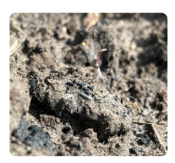
Close-up of biochar and soil at the study site.

The biggest caveat is that biochar is expensive. The UVM team purchased from Wakefield Biochar in Georgia, which markets biochar as an organic garden amendment. The team applied biochar at the rate of 17 tons/ac. Because of biochar cost, each of 16