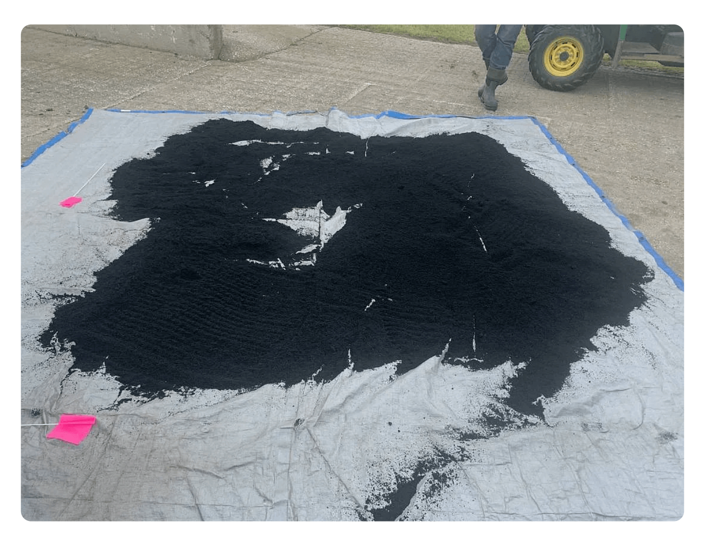
Some of the studied biochar prior to soil application.