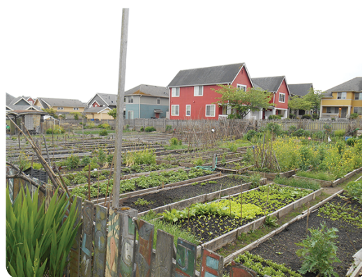
An urban farm and community garden nestles beside residences in Seattle, WA.

For example, one "citizen science" study, published by the USDA in 2012, found that urban gardens in New York City produced tomato plants with a yield of 4.6 lb/plant compared with a conventional average of 0.6 lb/plant ( https://bit.ly/3lepVmq ).