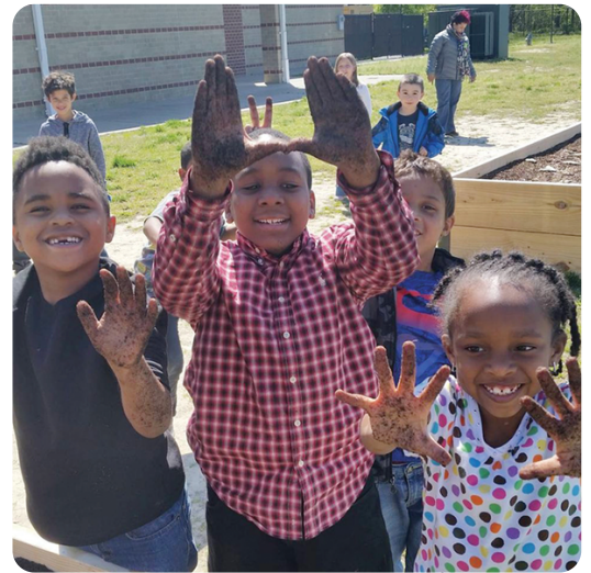
Kids show off soil-covered hands in the garden in Baltimore, MD.