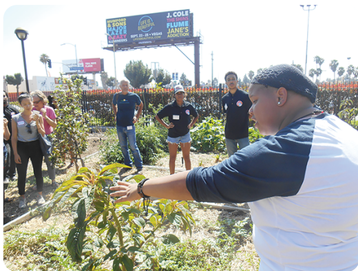
A youth farmer in Los Angeles County gives a tour of an urban