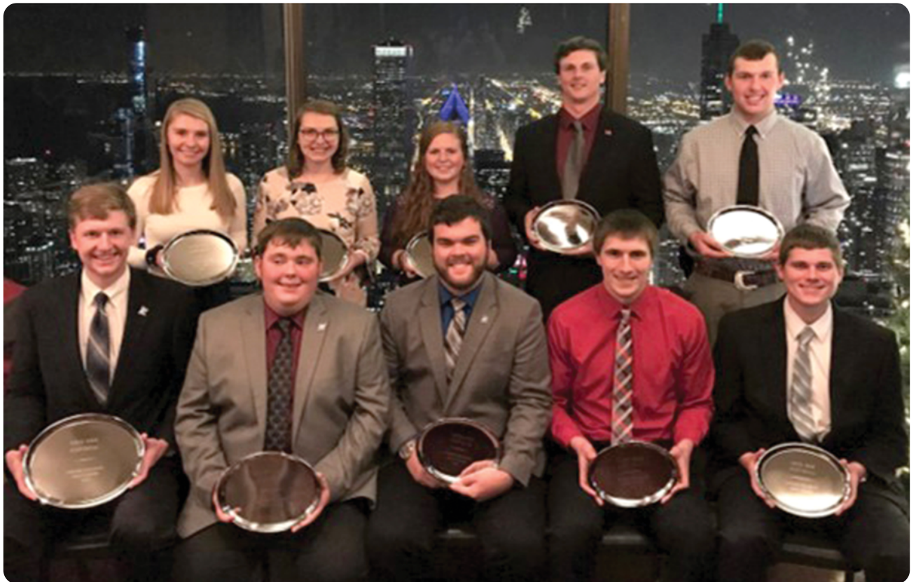
The top 10 individuals at the 2019 Chicago Crops Contest.

Kansas State University took first place in both the 86th annual Kansas City Collegiate Crops Contest and the 91st annual Chicago Collegiate Crops Contest in November 2019. The University of Wisconsin–Platteville placed second at both contests. Finishing third was Iowa State University at Kansas City and Purdue University at Chicago. Virginia Tech placed fourth at both events. Other teams participating in both contests were the University of Minnesota–Crookston, Murray State University, Oklahoma State University, and South Dakota State University. Michigan State University and the University of Wisconsin–Madison also competed in Chicago.