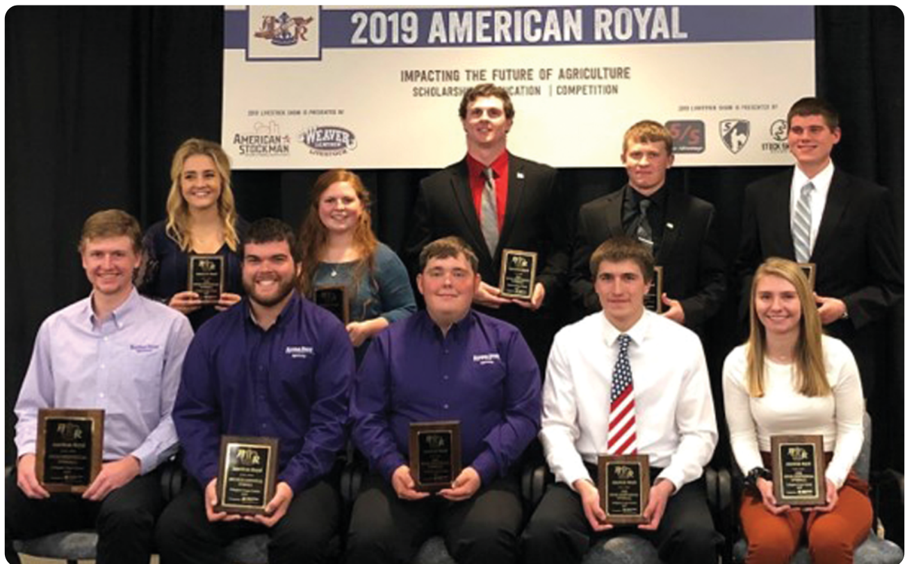
The top 10 individuals at the 2019 Kansas City Crops Contest.

At Chicago, the contest was held at Loyola University Water Tower Campus. CME Group was the major sponsor and hosted a pre-contest tour at the CME Globex trading center. The top five individuals in Chicago received scholarships from CME Group. Donors of the trophies and plaques for Chicago were GROWMARK and the Society of Commercial Seed Technologists. ASA and CSSA also provided support for contest activities in Chicago.