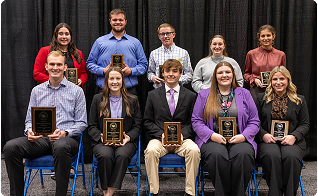
Top 10 individuals at the 2025 Kansas City Collegiate Crops Contest.