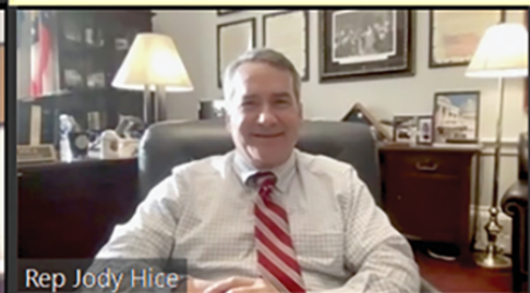
Rep Jody Hice