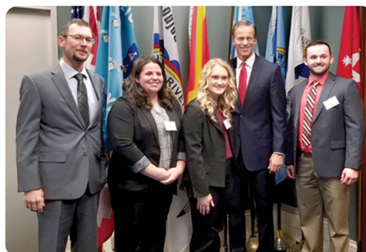
Team North Dakota–South Dakota meet with Sen. John Thune (SD; second from right) for the 2020 Congressional Visits Day.

All CVD participants will receive extensive advocacy and communication training before meeting with their members of Congress. You will work in small teams with other Society members, students, and CCAs to share the impact and importance of funding for food, agriculture, and natural resources research. Participants will also have the opportunity to hear presentations from federal agency leadership. And whether you participate in person or virtually, you will have the opportunity to meet other science advocates from across the country and form invaluable professional networks.