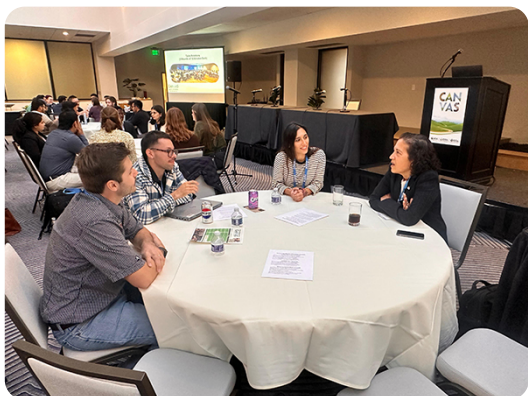
Graduate students chatting with mentors during a “speed-date” style interaction at the Graduate Student Networking Session.

The Graduate Student Networking Session returned to CANVAS 2025 for another successful year, continuing its mission to foster meaningful peer and mentor interactions among graduate students. Sponsored by Corteva Agriscience, the committee invited mentors from a wide range of disciplines and career paths to engage with graduate student mentees.