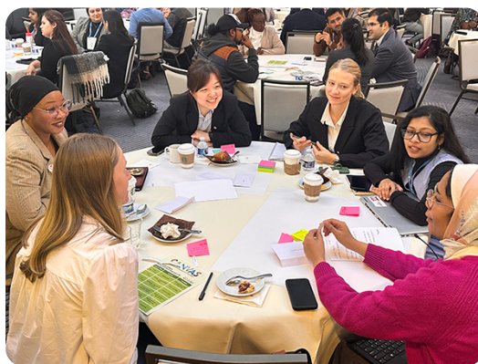
Graduate students connecting and exchanging ideas during the Graduate Student Leadership Conference.

We received more than 100 applications, and 90 graduate students were selected to participate in the event. The morning program featured an engaging scientific communication workshop where participants learned to pitch their ideas effectively, use social media to communicate science, and speak confidently in public. In the afternoon, participants engaged in hands-on activities focused on addressing workplace issues and managing conflict. To conclude the session, we hosted an engaging panel featuring professionals from diverse career backgrounds, who participated in an interactive dialogue with graduate student attendees and shared valuable insights drawn from their lived professional experiences.