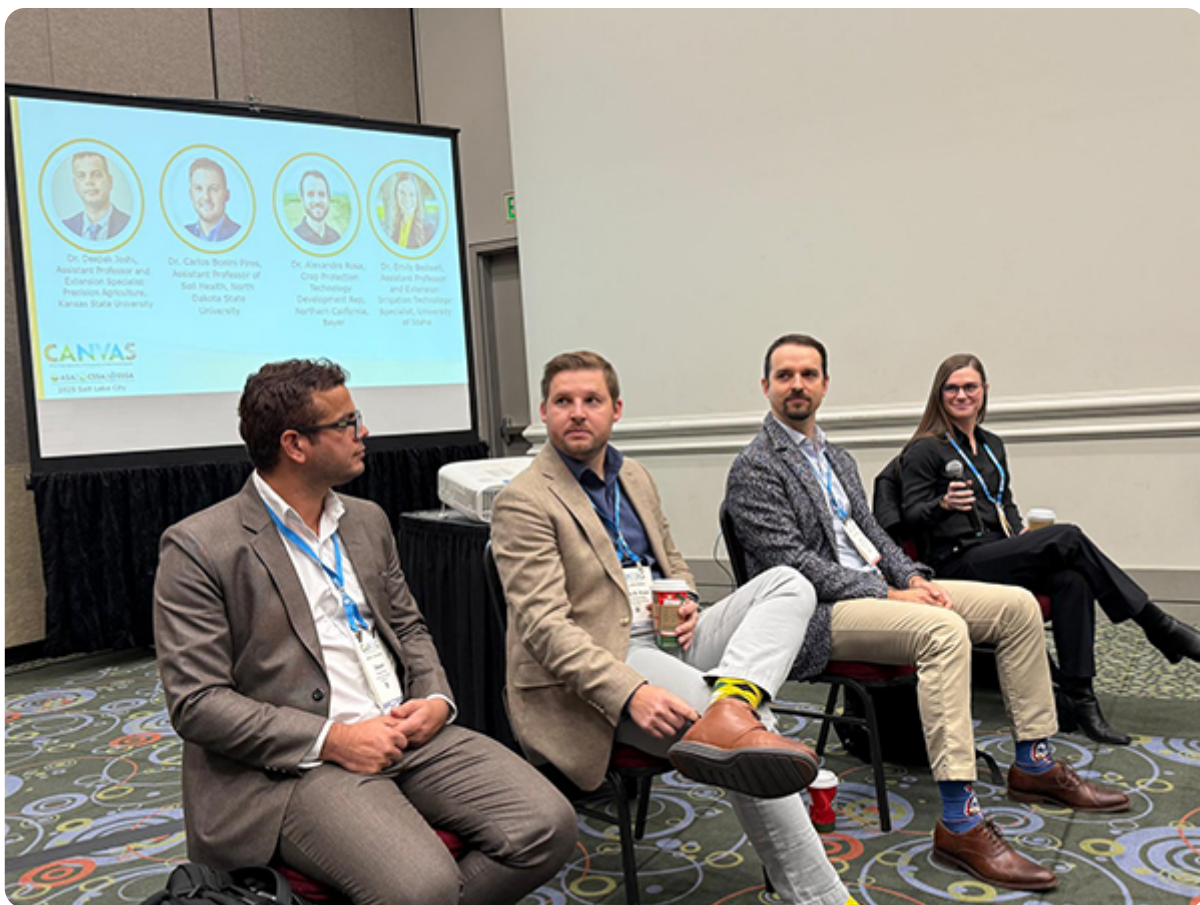
Panelists sharing insights during the “Transitioning from Graduate School to Early Career” session.

Another session brought back to CANVAS 2025 by popular demand was the panel “Life After Graduate School—Transitioning to Early Career.” This session was designed to support graduate students who are approaching the transition into their early careers as well as early career professionals seeking practical guidance on how to successfully navigate this important career milestone. The session attracted more than 80 attendees and received highly positive feedback with participants noting that the discussion was especially valuable for identifying career pathways, understanding expectations beyond graduate school, and exploring new professional opportunities.