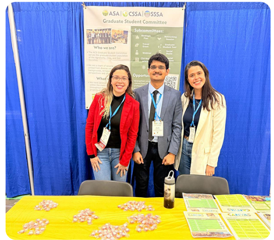
Graduate Student Committee members representing the committee at the career fair booth during CANVAS 2025.

We connected with a wide range of attendees, including graduate students, faculty members, and professionals from diverse disciplines. The booth provided a valuable platform for meaningful conversations, outreach, and relationship-building, making it a truly rewarding experience for the committee.