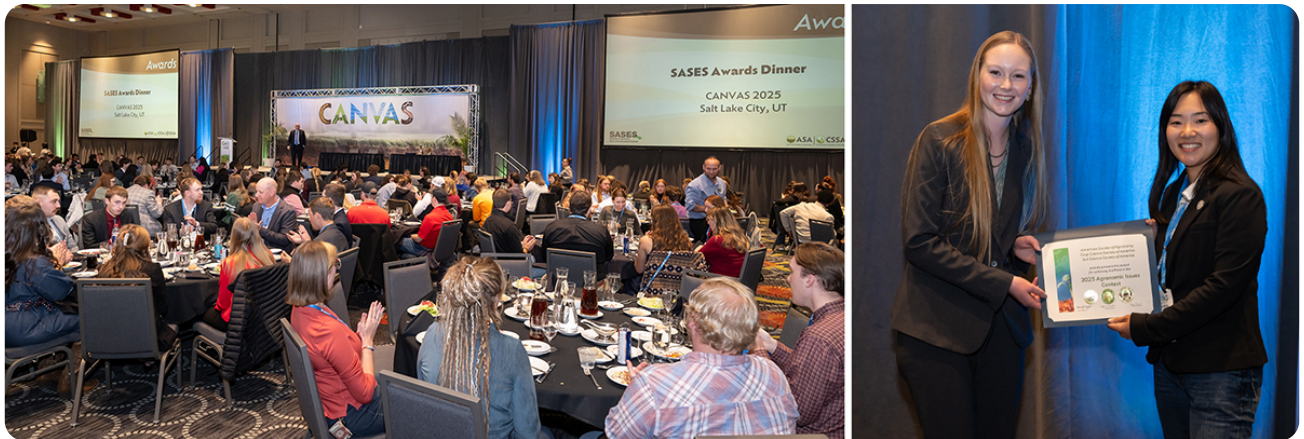
At the SASES Awards Dinner, student contest finalists were honored with certificates among their peers.

Finally, the CANVAS 2025 SASES program concluded Tuesday evening with the SASES Awards Dinner where student contest finalists were honored with certificates among their peers.