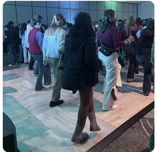
The student social at CANVAS 2025 featured dancing fueled by a professional DJ and refreshments.

The first full day of SASES programming began with the SASES Business Meeting where students reviewed their accomplishments over the past year and candidate selections