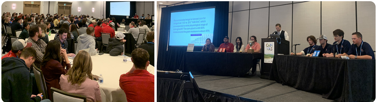
Twenty-six teams competed for the SASES Quiz Bowl trophy at CANVAS 2025.

Monday evening ended with the SASES Quiz Bowl where 26 teams competed for the SASES Quiz Bowl trophy.