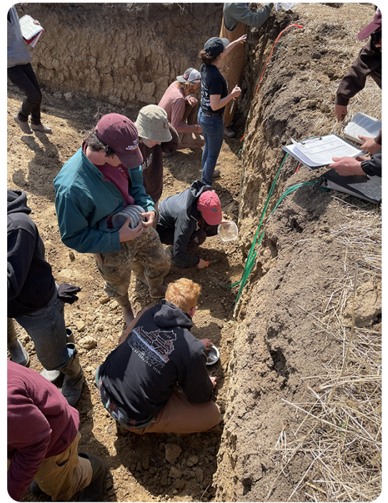
A group judging event at the 2024 National Collegiate Soil Judging Contest.

Enter the SSSA and ASA Boards! The committee reached out to both the SSSA and ASA Boards to ask for funding to make up the difference to be able to fund everyone's requests.