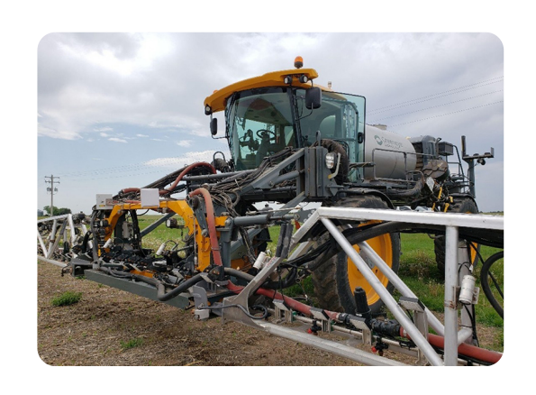
Figure 1. Greeneye Technology's precision sprayer used in this study.

Field experiments were conducted in 2022 at the University of Nebraska–Lincoln's South–Central Agricultural Laboratory near Clay Center, NE, to test Greeneye Technology's precision sprayer in corn (Figure 1) and in 2023 at the Eastern Nebraska Research Extension and Education Center near Mead, NE to test John Deere's precision sprayer in soybean (Figure 2). Experiments consisted of